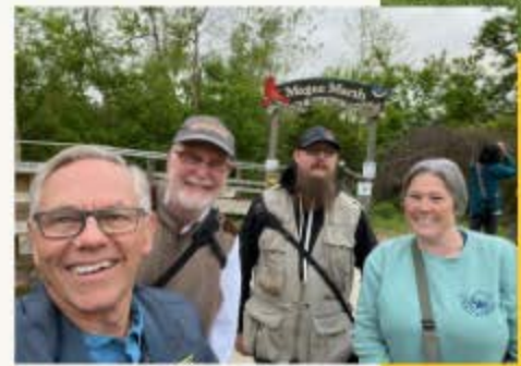
Bird Week Photo Walk