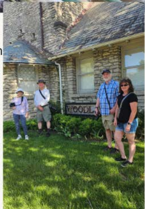
WOODLAWN PHOTO WALK

In the realm of photography, each click of the shutter is an opportunity to shift our viewpoint. Whether we are capturing the intricate details of a flower, the grandeur of an architectural marvel, or the raw emotions of a candid moment, photography allows us to see familiar subjects in unfamiliar ways. This shift in perspective can reveal hidden beauty, evoke powerful emotions, and tell compelling stories that might otherwise go unnoticed. Let us remember that our destination as photographers is not a physical place but a state of mind. It is about constantly seeking new ways of looking at things, challenging our perspectives, and using our art to inspire others. As we embark on this journey, let us keep our eyes and hearts open to the endless possibilities that lie ahead. Happy shooting!