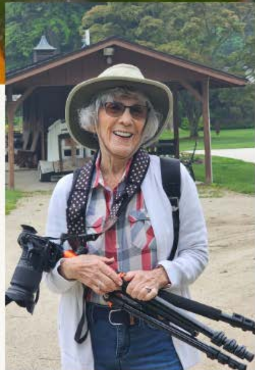
SCHEDL PHOTO WALK

We encourage you to RSVP for our upcoming activities, photo walks, and interest groups! By confirming your attendance in advance, you help us ensure that we have everything prepared for an enjoyable and fulfilling experience. RSVP allows us to organize the events more efficiently, offering you the best possible environment to connect with fellow members and explore shared interests. It also helps us cater to specific needs and preferences, such as transportation requirements or other arrangements. Please take a moment to let us know if you'll be joining us so we can make these events memorable for everyone. Thank you for your cooperation!