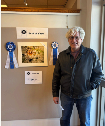
Best of Show