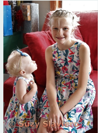
First Place Photos Assignment and Open Advanced Division