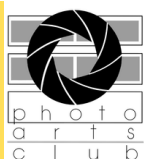
PHOTO ARTS CLUB 5403 Elmer Drive Toledo, OH 43615

Reminder to members: we have returned to scheduling our Monthly Board Meetings on the first Thursday of each month.