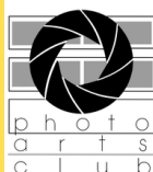
PHOTO ARTS CLUB 5403 Elmer Drive Toledo, OH 43615

www.photoartscluboftoledo.com info@photoartscluboftoledo.com