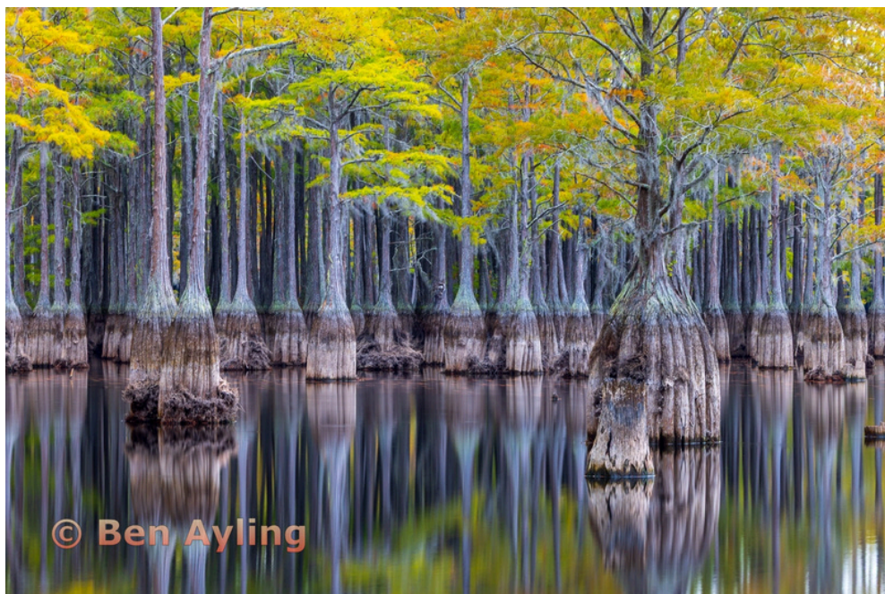
"Still Waters on the Cypress Lake" by Ben Ayling Advanced Open - 2nd Place