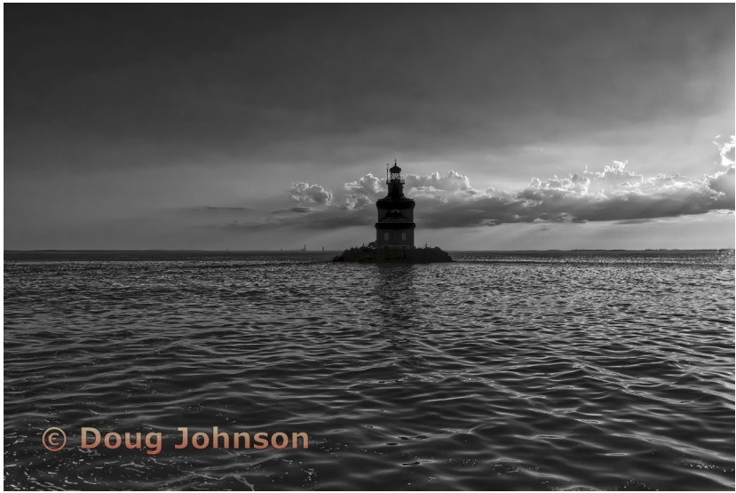
First Place Open Intermediate