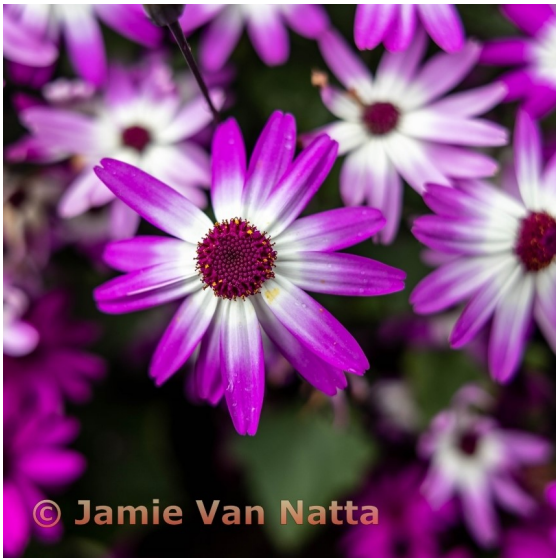
First Place Open Intermediate