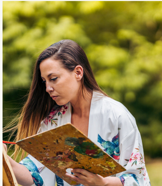
ARTIST IN THE GARDEN

The quote “When I have a camera in my hand, I know no fear” by Alfred Eisenstaedt highlights photography's empowering and liberating effect. This statement suggests that holding a camera provides a sense of confidence and courage, allowing the photographer to explore the world without hesitation or fear. The camera becomes a shield and a tool for discovery, enabling the photographer to confront challenging situations and capture moments that might otherwise be missed. It symbolizes a form of artistic freedom and emotional resilience, encouraging photographers to step beyond their comfort zones. Considering this, how do you think taking photographs has influenced your perception of and interaction with the world around you?