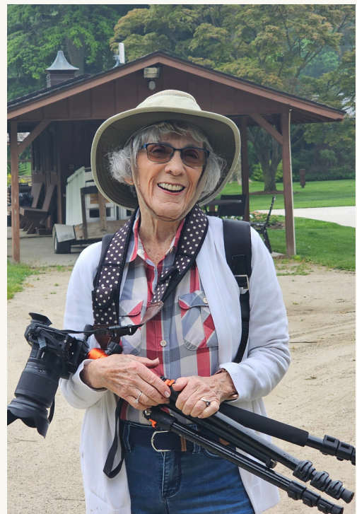
SCHEDL PHOTO WALK

We encourage you to RSVP for our upcoming activities, photo walks, and interest groups! By confirming your attendance in advance, you help us ensure that we have everything prepared for an enjoyable and fulfilling experience. RSVP allows us to organize the events more efficiently, offering you the best possible environment to connect with fellow members and explore shared interests. It also helps us cater to specific needs and preferences, such as transportation requirements or other arrangements. Please take a moment to let us know if you'll be joining us so we can make these events memorable for everyone. Thank you for your cooperation!