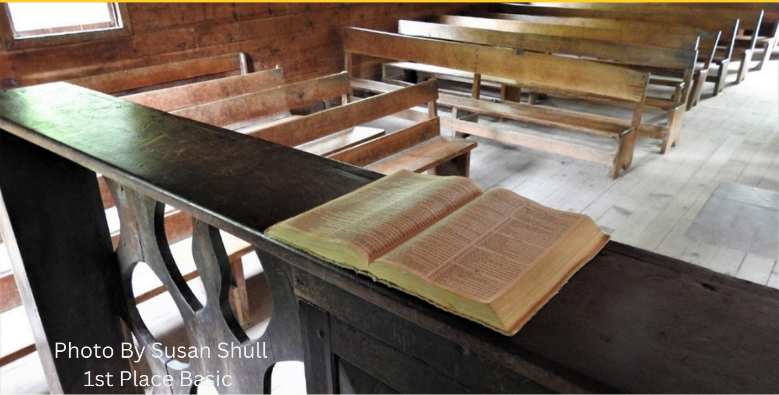
1st Place Basic