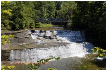
2nd Place Assignment Basic