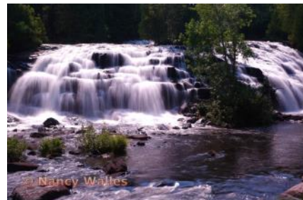
2nd Place Assignment Intermediate