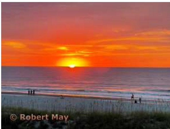
Basic 3rd Place