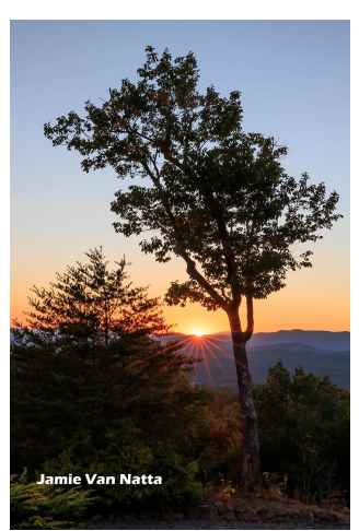
First Place Advanced Assignment