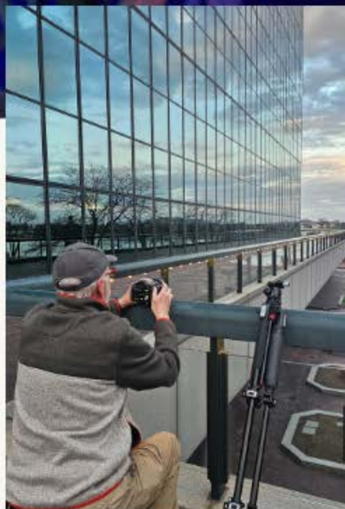
STARBURST PHOTO WALK