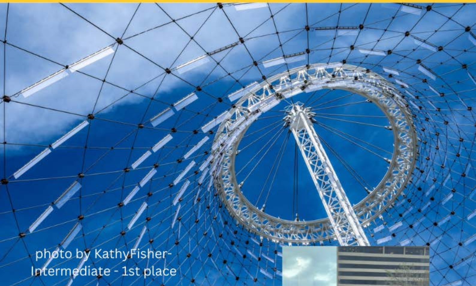
Intermediate - 1st place